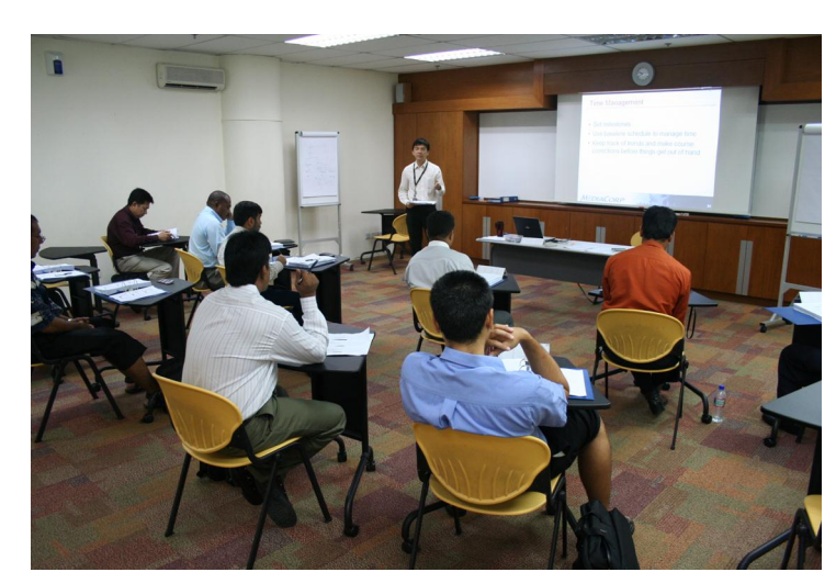
A lecture taking place as part of the CBA Singapore Ministry of Foreign Affairs Course, "Making the Leap: from Analogue to Digital", Singapore, June 2008.

This year saw the launch of the online distance-learning course ‰n Introduction to Digital Technology+ Following completion of its development the first course ran in April for 12 weeks with a second course in September. Because of the diversity of the 5 tutors and subject an administrator are involved. The course is split into 11 modules that range from the fundamentals of digital technology to practical planning, project management and infrastructure management.